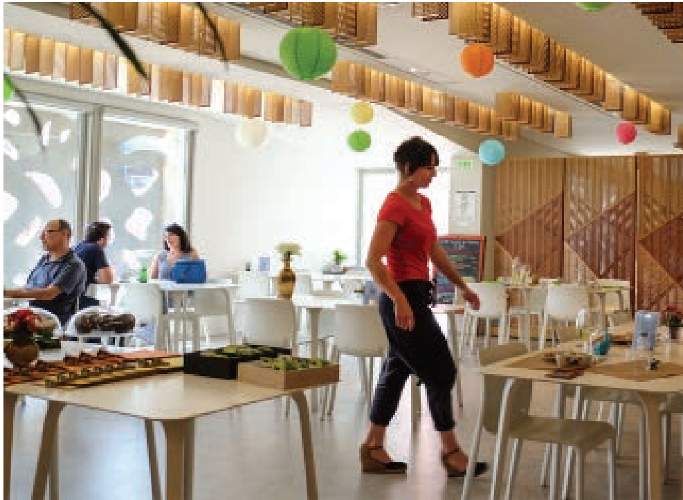
Le Café-restaurant at the LaM.