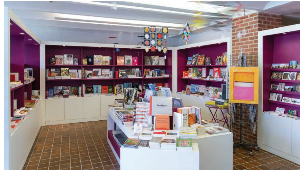
The LaM's gift-bookshop.

Tél. : +33 (0)9 63 52 51 96 / lecafedulam@gmail.com