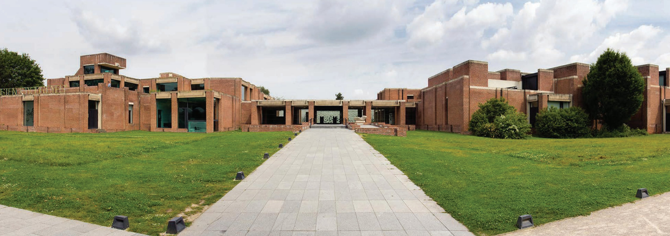
Exterior view of the LaM and its park, Villeneuve d'Ascq.