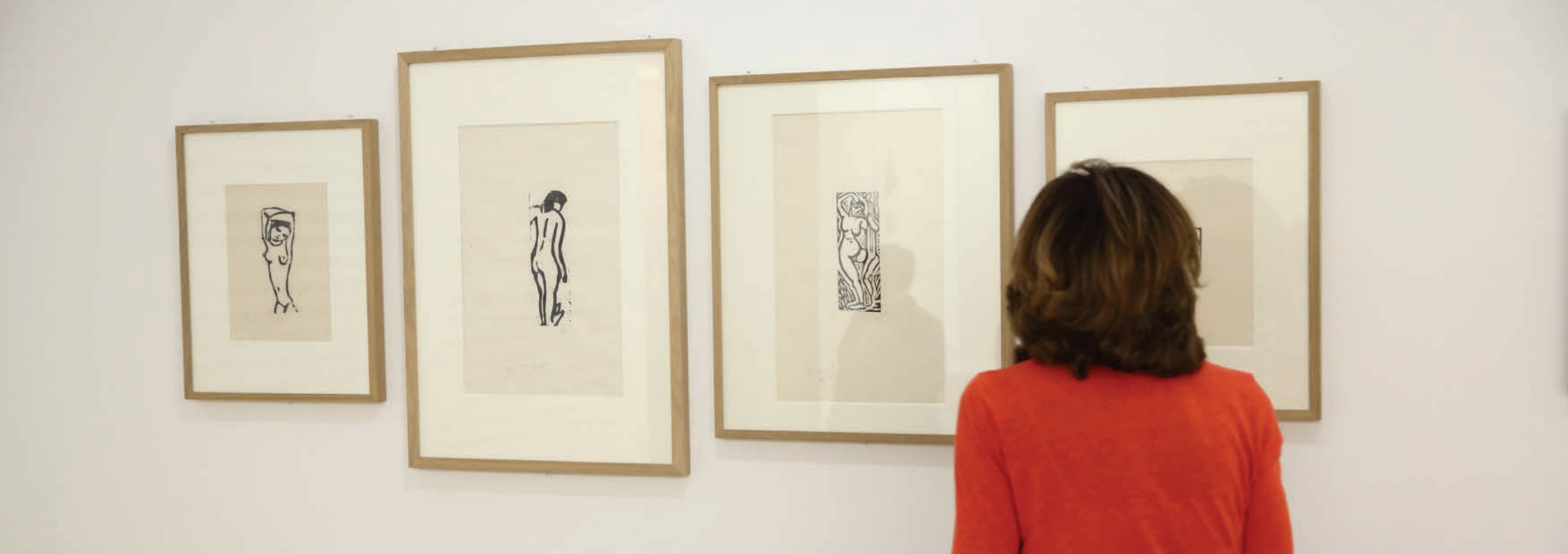
View of temporary exhibition, Picasso, Léger, Masson : Daniel Henry Kahnweiler et ses peintres.