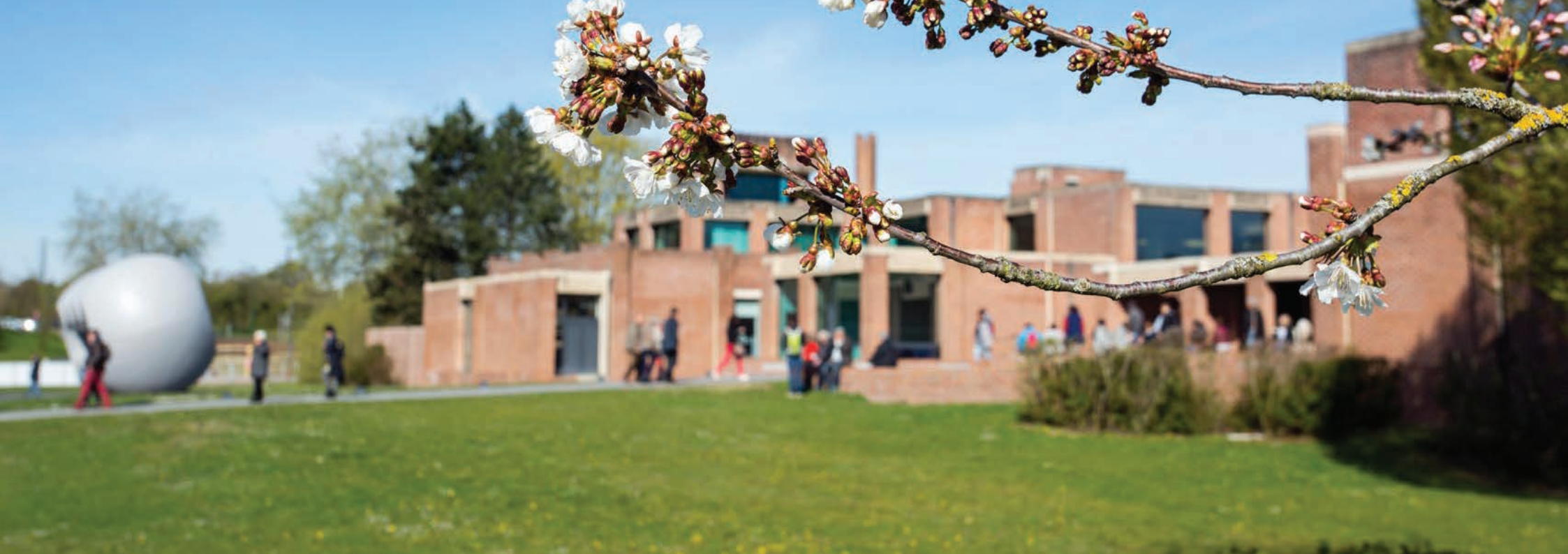
Exterior view of the LaM and its park, Villeneuve d'Ascq.