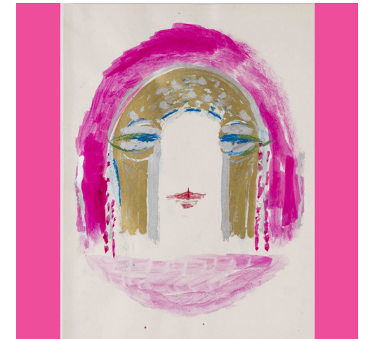
Marisa Merz, Madona di Marte [Madonna of Mars], undated. Mixed technique on rice paper ; 48.5 x 34 cm. Private collection. Courtesy Bernier Eliades Gallery, Athens.

Celebrated in 2013 by the award of a Golden Lion at the Venice Biennale, Marisa Merz was one of the leading artists on the Italian and international art scene and closely affiliated with the Arte Povera group. Thanks to the Fondazione Merz's collaboration and commitment, the LaM presents a selection of iconic works alongside previously unseen pieces, as well as major research work carried out in the archives.